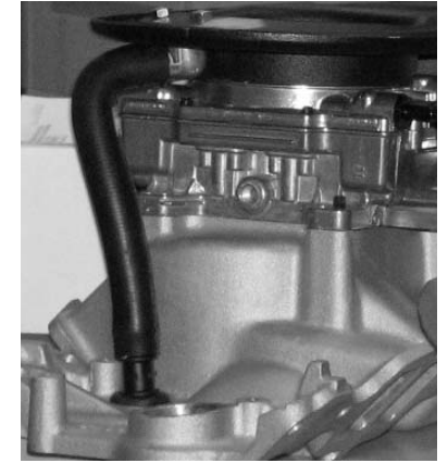
Breather Hose Sample Installation