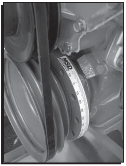
Figure 2 The Timing Tape Installed.