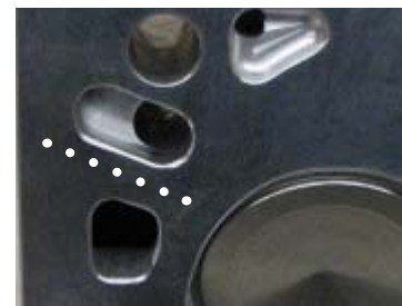
Figure 1 - Silicone Strip

INSTALLATION: Before final installation of the cylinder heads, several things need to be checked to assure proper engine operation: